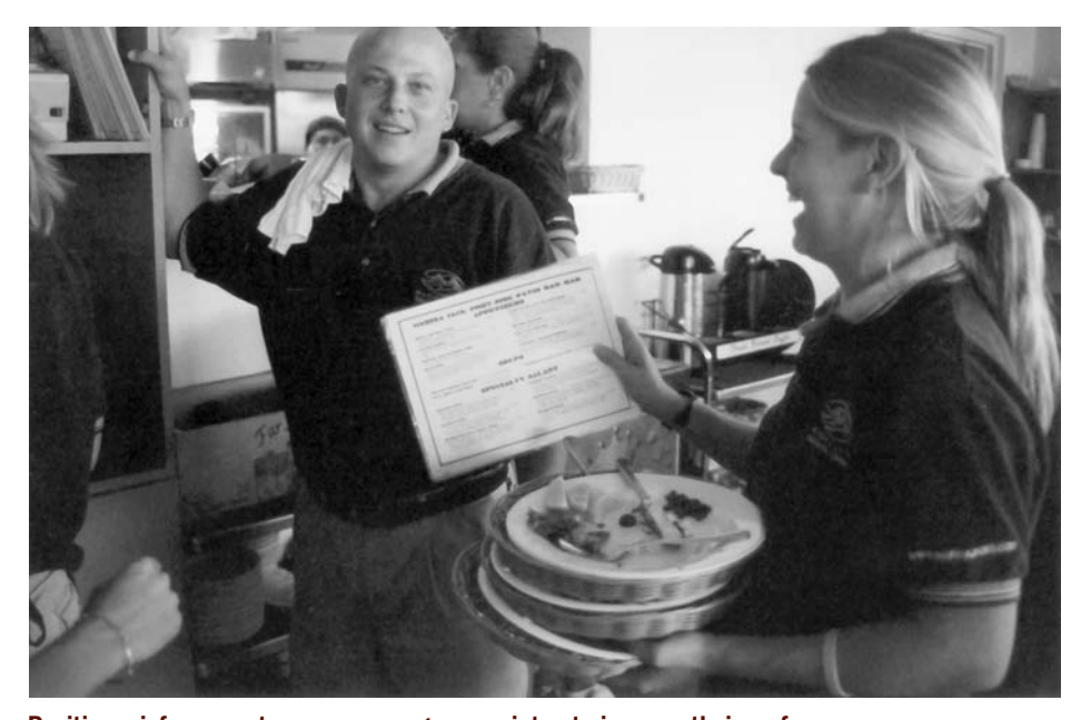
Positive reinforcements can encourage associates to improve their performance.

Even among the less routine jobs there is little you can change to make the work itself more interesting and challenging. The great majority of jobs are made up of things that must be done in the same way day after day. At the same time, many jobs depend to some extent on factors beyond your control: What people do each day and how much they do varies according to customer demand. Unless your workers happen to find this interesting and challenging (and some people do), it is difficult to structure such jobs to motivate people. But the situation is not hopeless. Later in the chapter we will see what creative management can do for even the dullest jobs.