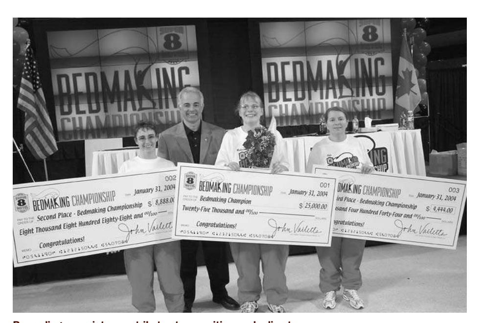
Rewarding associates contributes to a positive work climate.

Groups and group socialization are a normal part of the job scene. Often, groups break into cliques, with different interests and sometimes rivalries. You should not try to prevent the formation of groups and cliques. But if competition between cliques begins to disrupt the work, you will have to intervene. You cannot let employee competition interfere with the work climate.