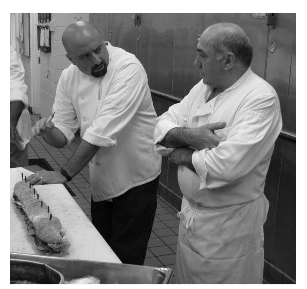
Clear communication between supervisors and associates is critical in a creative and positive work climate.

The second type of communication that people want from the boss is feedback on their performance . The most important thing a worker wants to know is, "How am I doing? Am I getting along all right?" Yet this expectation, this need, is usually met only when the worker is not doing all right. We tear into them when they are doing things wrong, but we seldom take the time to tell them when they are doing a good job. A few seconds to fill that basic human need for approval can make a world of difference in your associates' attitude toward you, and the work they do for you.