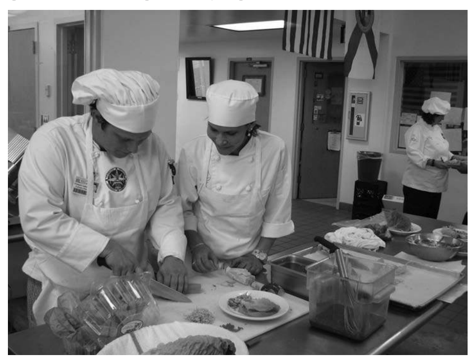
Making the job interesting and challenging is a key part of a supervisor's job.

Different things about the work turn different people on. Some are stimulated by working with guests: They get a kick out of making them welcome, serving them well, pleasing them, amusing them, turning an irate guest into a fan by helping to solve a problem. Some people are miserable dealing with guests and enjoy a nice routine job with no people hassles where they can put their accuracy and skill to work straightening out messy records and putting things in order. Some people like jobs where there is always some new problem to solve; others hate problems and like to exercise their special skills and turn out products they are proud of.