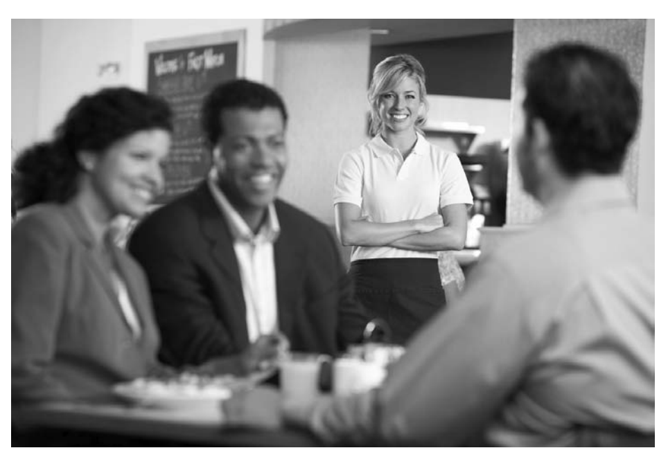
In the workplace, motivation goes hand in hand with productivity.